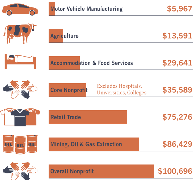
Gross Domestic Product (GDP), 2006 $ Millions

The Canadian nonprofit sector contributes more to the Gross Domestic Product (GDP) than other key industries. The GDP is the value of all goods and services produced in Canada.